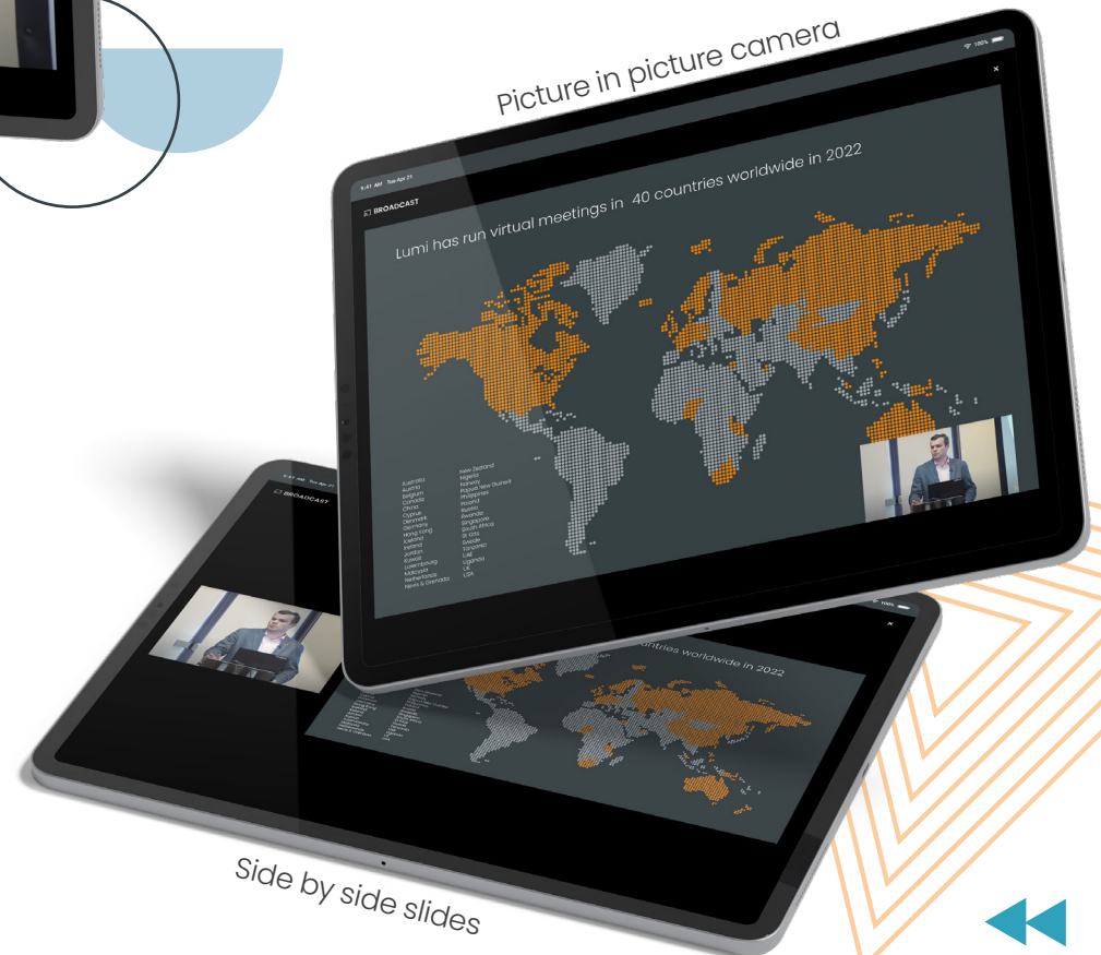
Side by side slides