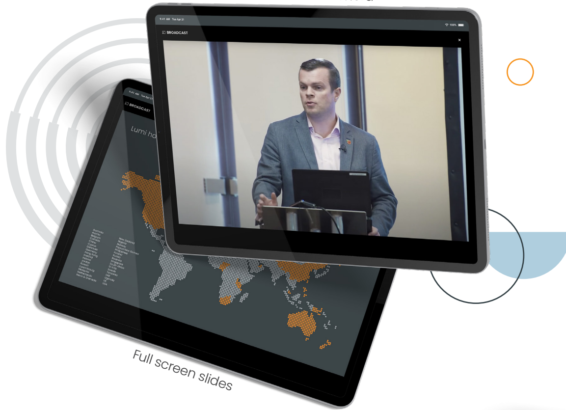
Full screen slides